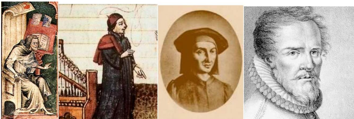
(Left to Right) Machaut, Dufay, Josquin & Senfl