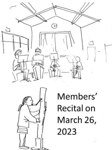
Members' Recital on March 26, 2023